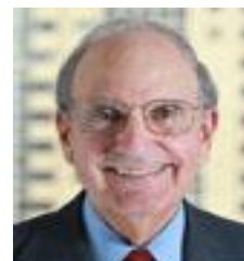
SENATOR GEORGE MITCHELL

For more info on our ontology based programs, please visit www.oic-world-peace.org/program-services.html